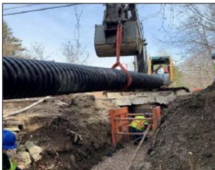
Recent Outfall Replacement Project on Williams Rd

Stormwater Projects in Action: Shore Acres Project Update With the goal of improving water quality and being funded through over $350,000 in grants awarded to the Town by the Agency of Transportation, the Shore Acres Project is ready to begin. The Department of Public Works is excited to announce that final approval plans have been received and construction is planned for late summer. As part of the Malletts Bay Initiative, a series of gravel wet-lands will be installed to slow runoff and allow pollutants to settle and be absorbed by plants. There will also be improvements to ditches to guide run-off, installation of new structures and piping to expand the existing runoff collections system, and upgraded stormwater outfalls within the project areas to limit erosion and protect the Moorings Stream that eventually enters into Malletts Bay.