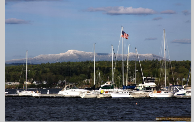
Above: View of Mt. Mansfield from Malletts Bay

Congratulations all - we've made it through winter! In this newsletter, learn about: