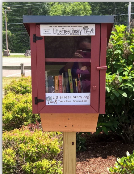
Little Free Library located at Airport Park